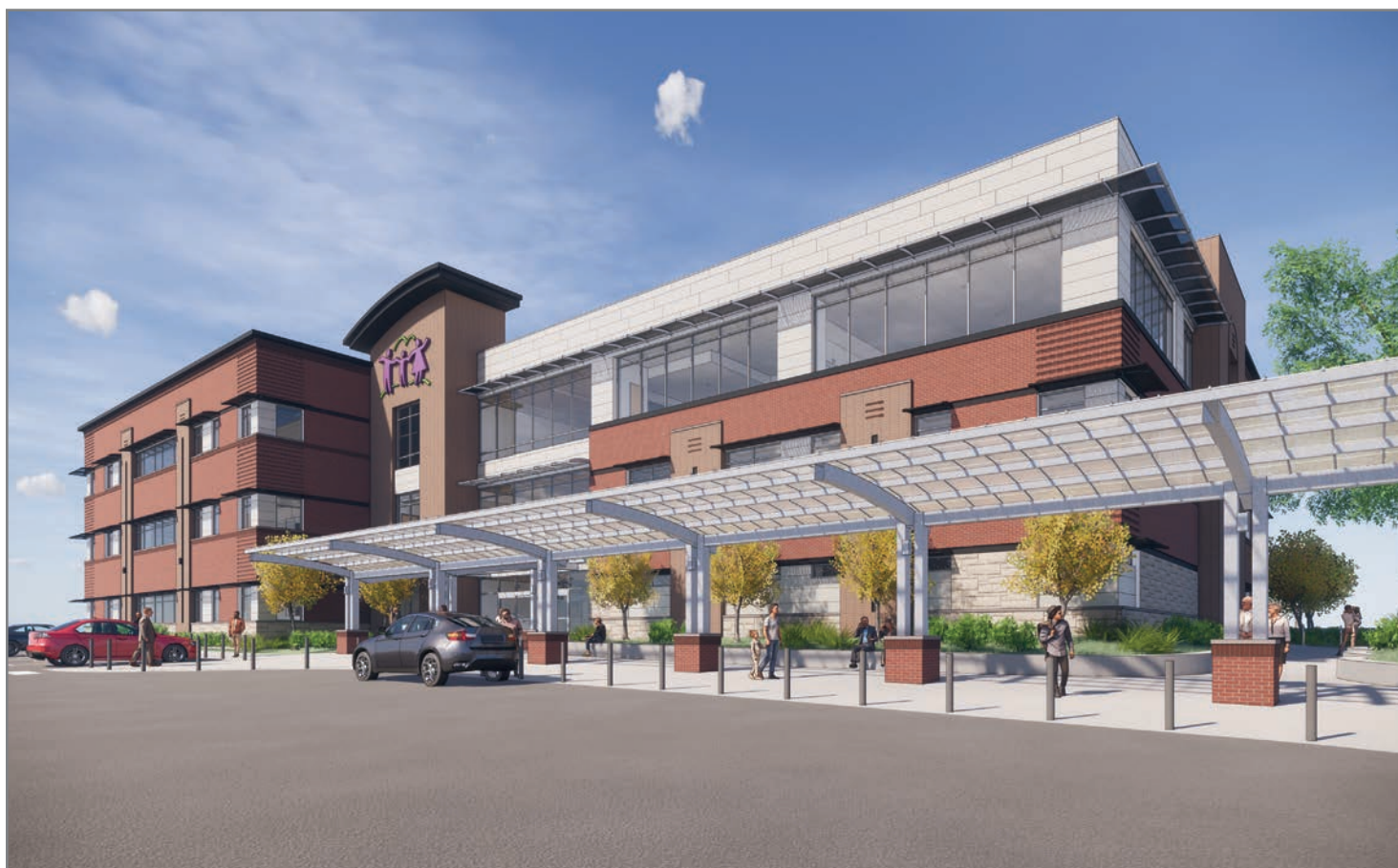
RTA Architects and Pueblo Community Health Center