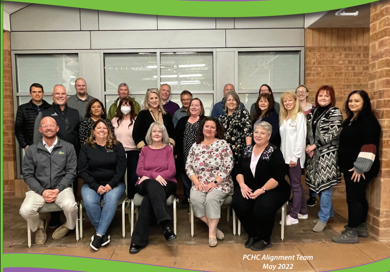
PCHC Alignment Team May 2022