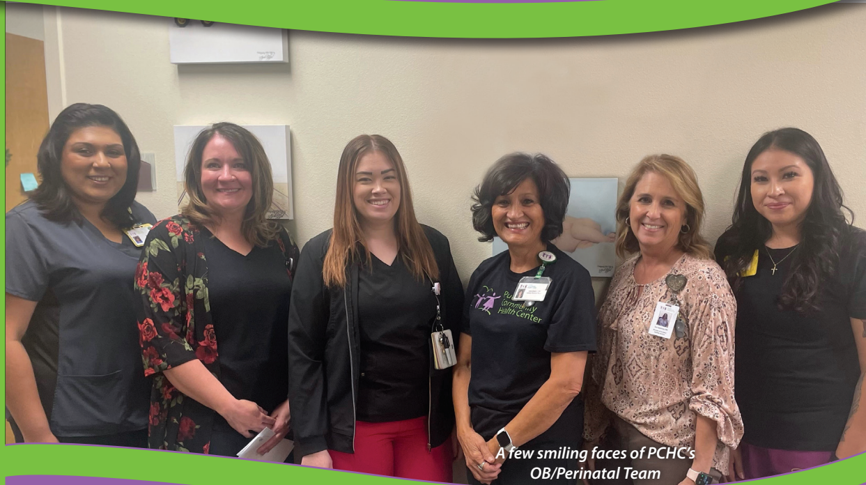
A few smiling faces of PCHC's OB/Perinatal Team