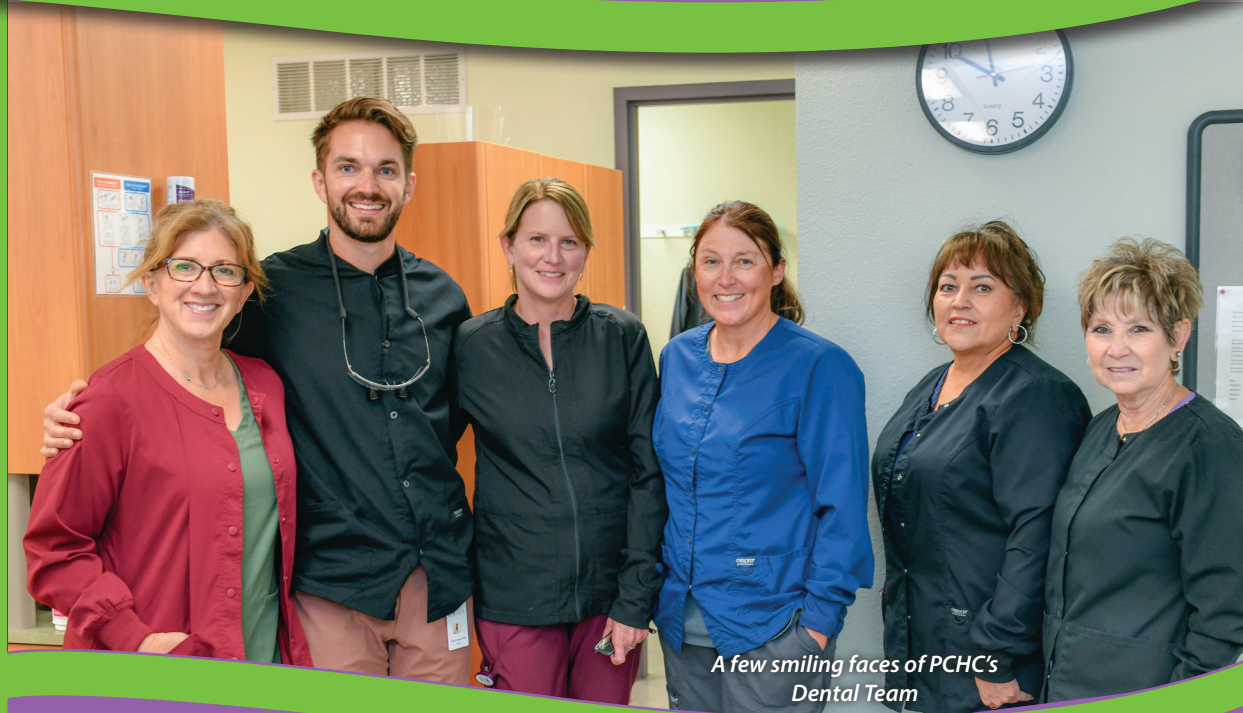
A few smiling faces of PCHC's Dental Team